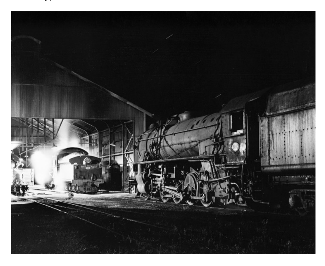
Photo taken by Peter at Collie locomotive depot, Western Australia, 16 February 1971.